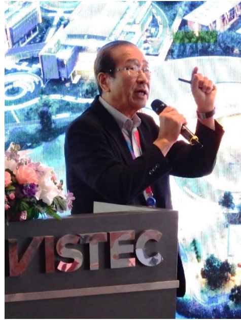
(Right) Overview of KU–VISTEC relationships by Prof. Susumu Kitagawa