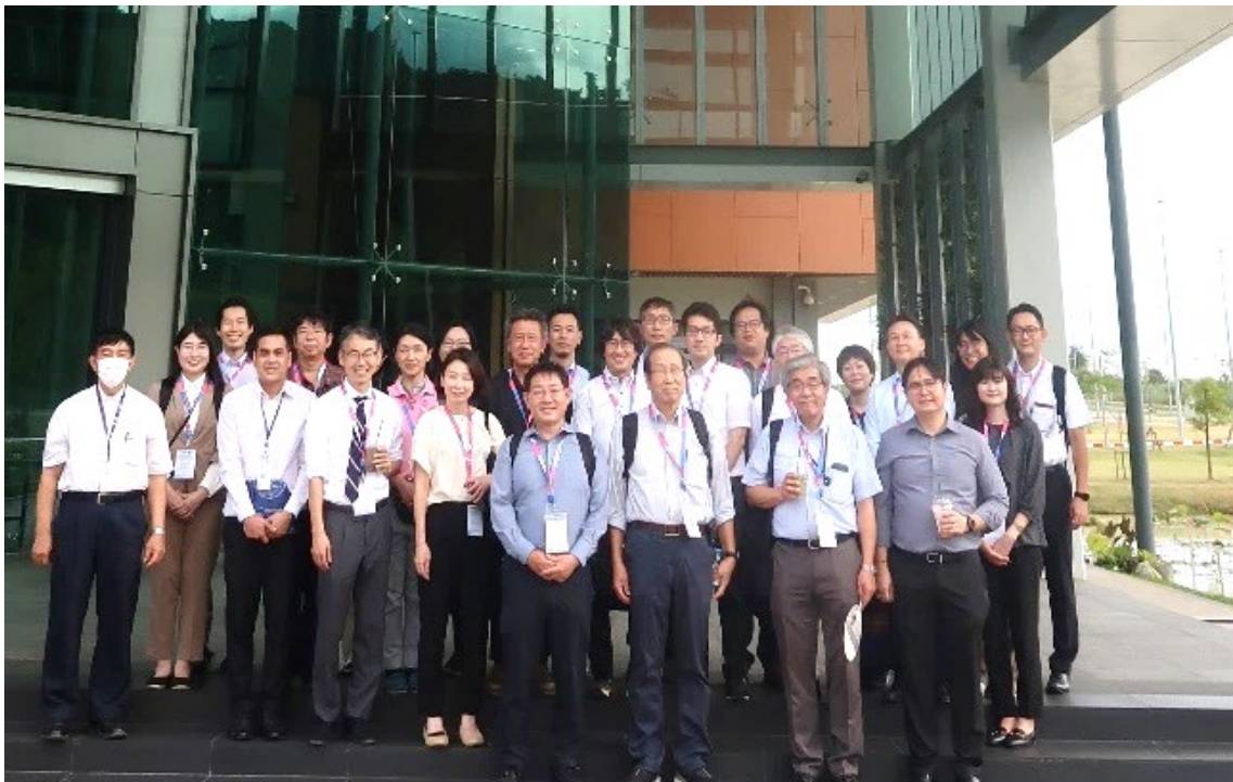
Tour of the Eastern Economic Corridor of Innovation (EECi)