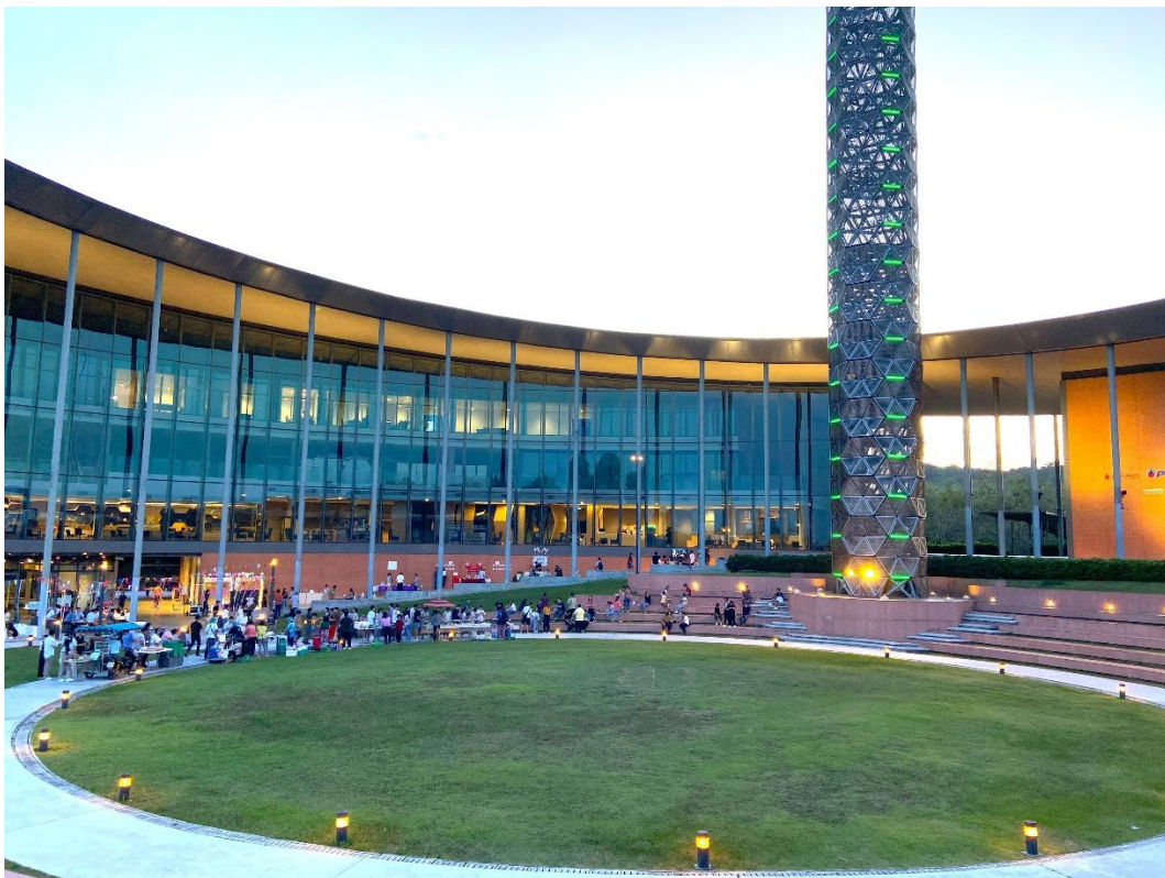
The VISTEC campus