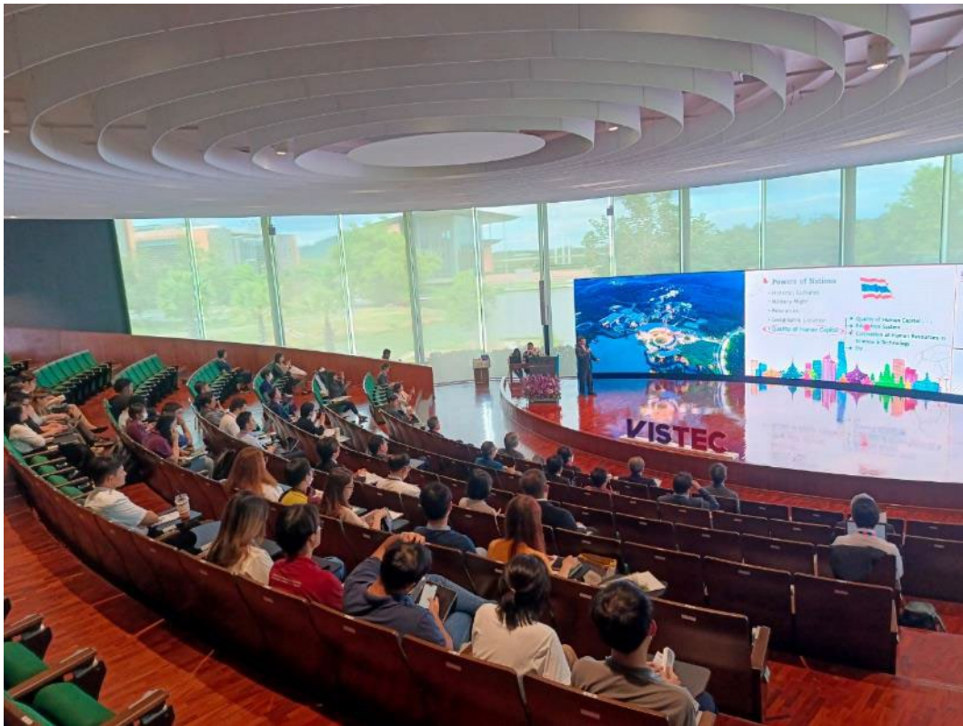
The symposium venue